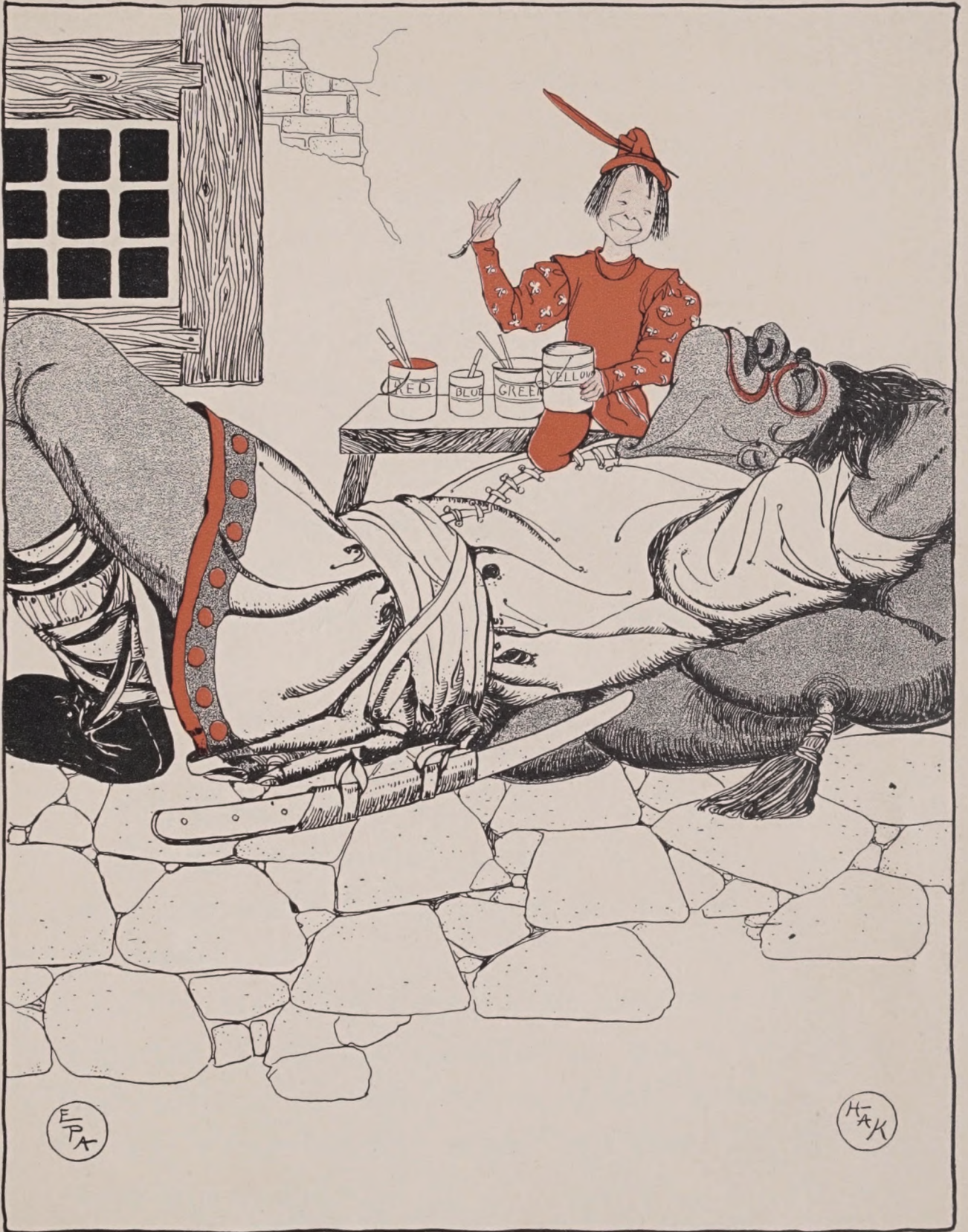
THE BOY SET TO WORK TO DECORATE THE GIANT DILL.